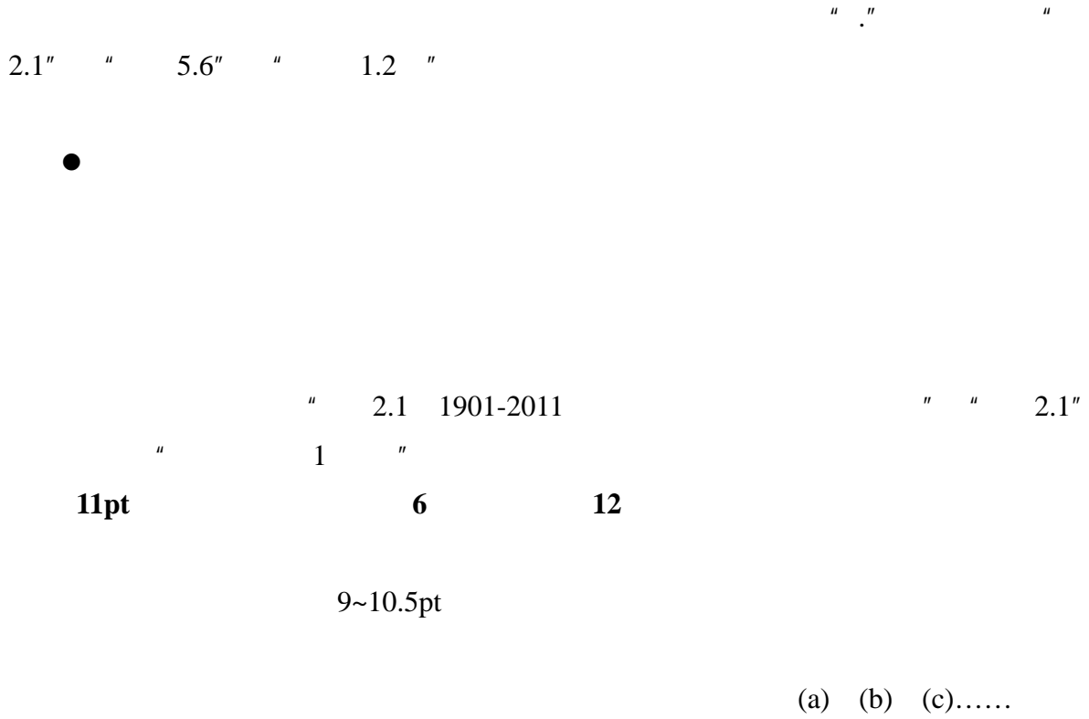
" Fig 2.1 Distribution of annual mean temperature Northwest China from 1901 to 2011"